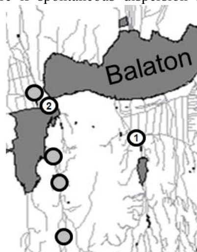
Localities of the Chinese sleeper (1: Boronkai-patak, 2: Zala-torok)

Beside of these facts, we have to note, that the new locality found on the Boronka-stream is situated to the vicinity of the Marcali-reservoir, a lake used for fish production. Therefore the escape of Chinese sleeper from the reservoir also cannot be excluded. In this case, multiple introduction routes are assumed to the drainage area of the lake.