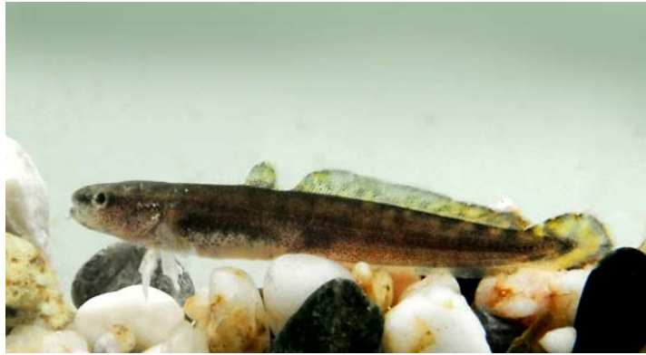
Burbot juvenile from the Holt-Tisza backwater at Tiszafüred