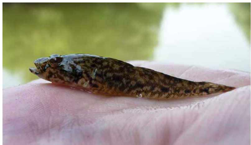
One of the Kessler's gobies caught in River Ipoly/Ipel

On 25th May 2012 we carried out a routine fish stock assessment in the River Ipel section between Szob and Ipolydamásd (2-3 rkm) for the Danube Research Institute of the Centre for Ecological Research of HAS. The low water level provided favorable sampling conditions for electrofishing, however, the catch was not considerable. We sampled 18 fish species on the 1 km long section. Among the collected fishes, there were 41 individuals of Kessler's goby ( Ponticola kessleri ). Their standard length varied between 28 and 55 mm. We collected gobies in the largest numbers on the rock banks under the railway bridge near Szob, but we caught this species from all the slowly flowing sections with gravelled and rocky riverbanks. This fish species was first registered from the