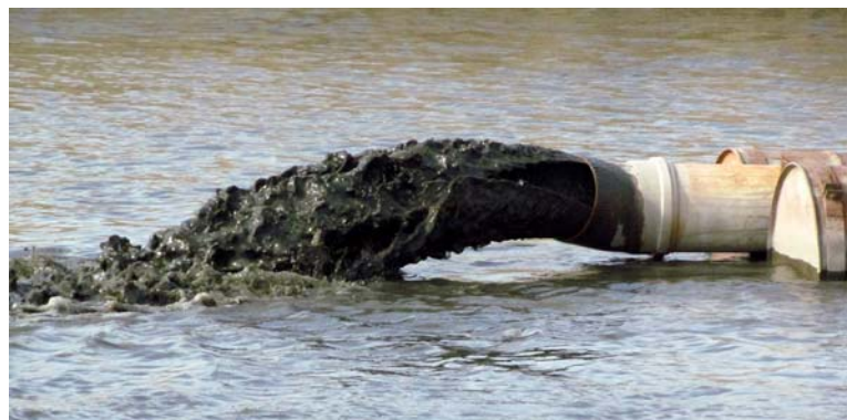
The way of the mud to the sedimenting pond

Because of low the velocity the mud is depositing in the pond, and the water flows back to the side arm. According to our previous observations, fish may enter the pump, and cross the mechanical system without any injury, but after that they are