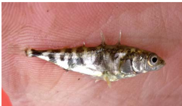
Western threespined stickleback from Drava River

Previously, three morphological forms of the threespined stickleback ( Gasterosteus aculeatus ) were distinguished by the number of lateral bony scutes. These forms were leiurus , trachurus and semiarmatus . But for now this taxa has been split into two species. The less armored form ( leiurus ), which spreaded mainly in western and southern Europe became Gasterosteus gymnurus (western threespined stickleback), while the more North- and East-European, full armored form was named Gasterosteus aculeatus (threespined stickleback). The half-armored semiarmatus is regarded as the hybrid of the two species, with the addition