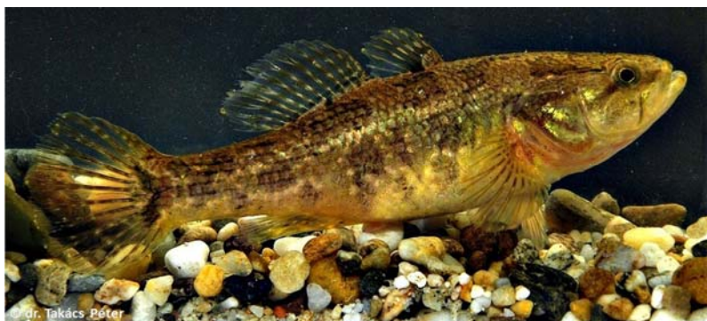
Chinese sleeper from the drainage system of Lake Balaton

The invasive species Chinese sleeper ( Percottus glenii Dybowski, 1877) continues its spread in the drainage system of Lake Balaton. Two new localities were found by the researchers of Balaton Limnological Institute (HAS CER BLI). Two specimens were found at