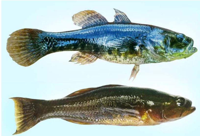
Amur sleepers with normal caudal fin (above), and with abnormal caudal fin (below)

During field sampling we can rather often observe strangely formed fish individuals. Our short paper is reporting on an Amur sleeper specimen presenting an abnormal caudal fin. The fish was found on 7th September 2011 in the Cserőközi-Holt-Tisza oxbow-lake near Tiszaszőlős. The specimen on the bottom of this picture has got a concave shaped caudal fin instead of the normal convex shaped caudal fin.