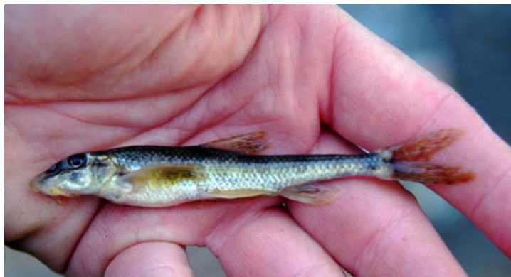
The first Danube gudgeon from Hernád River in Hungary

After taking photos the fish was released to the river. Later four other adult individuals and 27 Kessler's gudgeons ( Romanogobio kessleri ) were also caught. Because of this result we also took samples 2 kilometers down the river, near Göncruszka, on the right bank of the river. On the similar habitat one more adult Danube gudgeon was caught. Next day the investigation was continued near Zsujta where we did not found this species. But near Gönc, on the left riverbank at Banga-meadow 5 adult individuals were caught. The presence of the gudgeons is very interesting, because in the September of 2006 not even Kessler's gudgeon were caught on the downstream of the dam in Hernádszurdok. Probably the gudgeons were drifted down by the flood in 2010 from our northern neighbours. It would be interesting to monitor the life of the population in the Hungarian reach of the River Hernád.