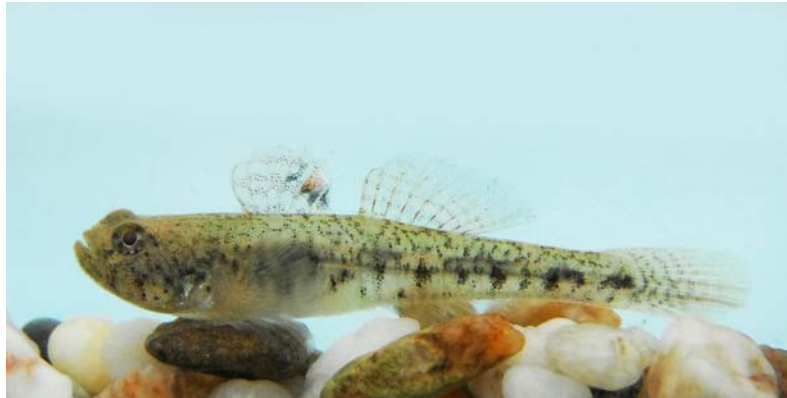
Dwarf goby of only 3 cm body length from the Tisza

On 25th May 2012 we were collecting data on recruitment of early spawning predatory fish species in the littoral zone of the Tisza-tó reservoir near Tiszafüred. During collection of samples of this year's young pike, pikeperch and asp by the help of a 6 mm mesh size net we found a small fish not described as far from Tisza River. On the basis of a preliminary examination we can state that the new-comer belongs to the genus of dwarf gobies Knipowitschia achieving a body length of only 3-4 cm.