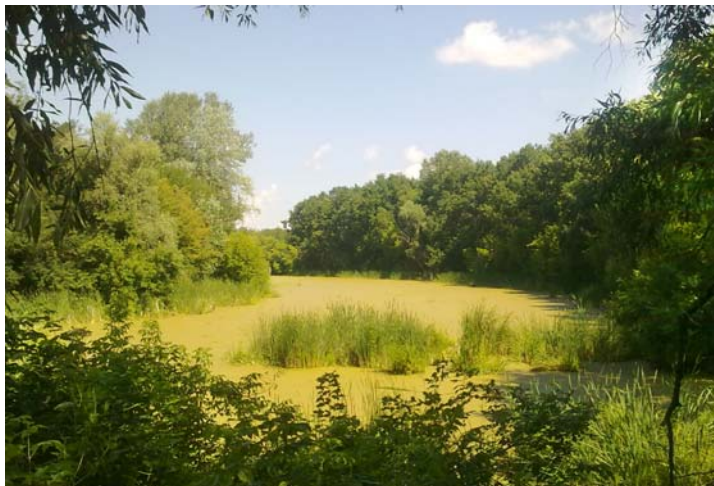
The Cserőközi-Holt-Tisza

Cserőközi-Holt-Tisza is situated along the border of Tiszaderzs and Tiszaszőlős, it has arisen during the regulation of Tisza river in 1865. Its area is 192,74 acres, the length is 10.5 km, the average width is 74m and the average depth is 0.7m. Resulting from its position on the protected bank it provides quite unstable water supplies. Although it is under local protection its water is used for irrigation.