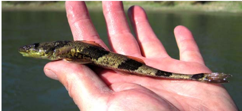
Streber ( Zingel streber ) from the Middle-Tisza

The sampling place was situated in Tiszajenő. The specimens belonged to three different age-groups, so a self-supporting population is