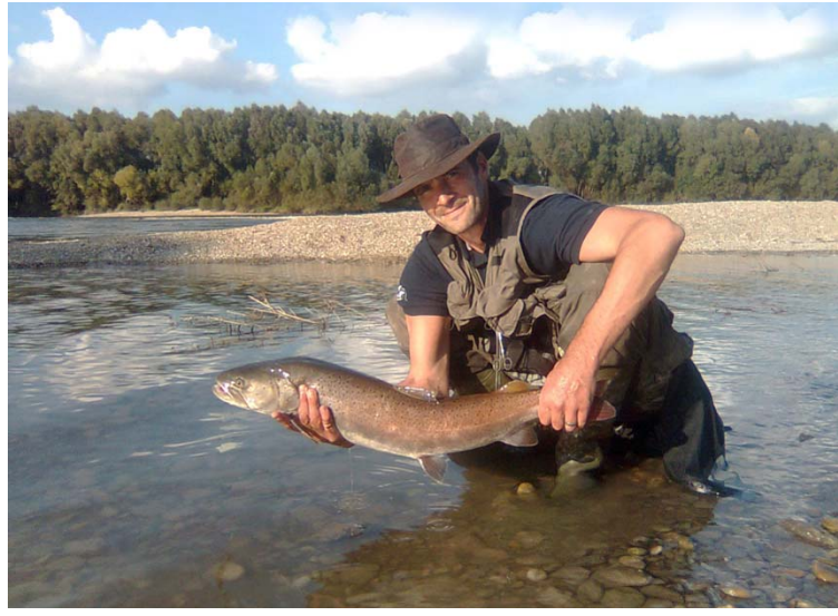
Huchen from Danube

'It prefers the pits of riverbed sections with stronger flow, bays with steep banks, places beneath stone revetments and on the lower parts of gravel banks', says the book 'Fishes of Hungary' by Harka and Sallai. The 96-centimeter-long specimen caught by Gyula Kraft on 7 October 2010 in the Danube near Győr was found in a habitat exactly corresponding to the description. This beautiful fish was caught by spin fishing and was lifted out of water only to get photographed, then it was released back to the water of Danube.