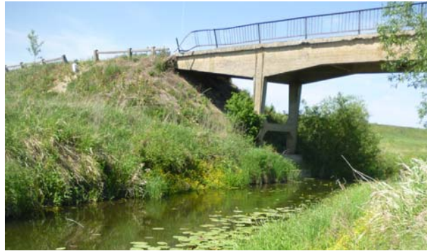
The Stream Ér near Pocsaj: the new locality of Chinese sleeper

The exact geographical site coordinates are: 47°17'1.24" N, 21°50'23.10" E. So it seems that expansion continues unabated and not remain a watercourse or stagnant water of the Tisza River Basin in Hungary, which would remain free of this adventive fish species.