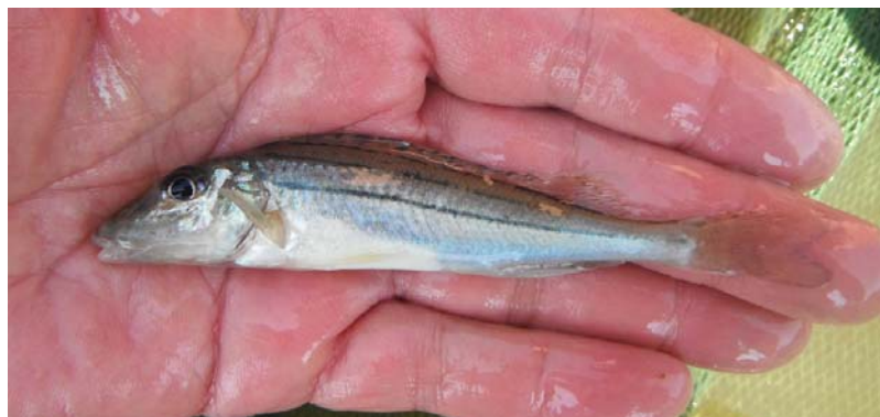
Striped ruffe from the Zagyva